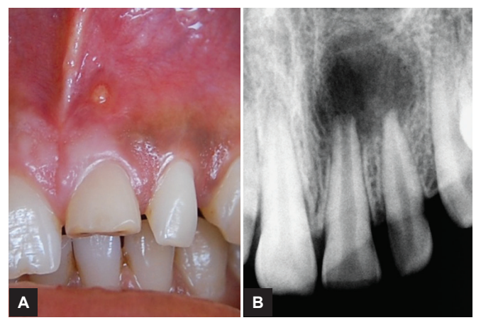
Figs 1A and B: (A) Ellis class III fracture in 21 with sinus opening; and (B) preoperative intraoral periapical radiograph showing open apex in 21 and large radiolucent lesion involving 21 and 22

fracture in relation to 21 was evident and an intraoral sinus tract was present (Fig. 1A). Thermal and electric vitality tests elicited a negative response in relation to 21 and 22. Periapical radiograph showed incomplete root formation with wide open apices in relation to 21 and a large radiolucent lesion with a well-defined margin around the apex of 21 and 22 (Fig. 1B). The patient and accompanying parent were informed about the diagnosis and treatment options. They opted for nonsurgical endodontic treatment and informed consent was taken. Thus endodontic treatment with apexification and TAP dressing was planned.