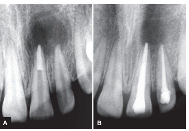
Figs 2A and B: (A) Mineral trioxide aggregate apical plug of 5 mm in 21; and (B) postobturation radiograph

After 3 months dressing was removed, canals were debrided with 2.5% NaOCl, followed by 17% ethyelenediaminetetraacetic acid and final rinse with 2% chlorohexidine. The canal was dried with paper points and MTA was placed with MTA carrier in the apical portion of the canal; subsequent increments were condensed with hand pluggers till 5 mm thickness of MTA was achieved in relation to 21 (Fig. 2A). A wet cotton pellet was placed and access cavity was sealed with